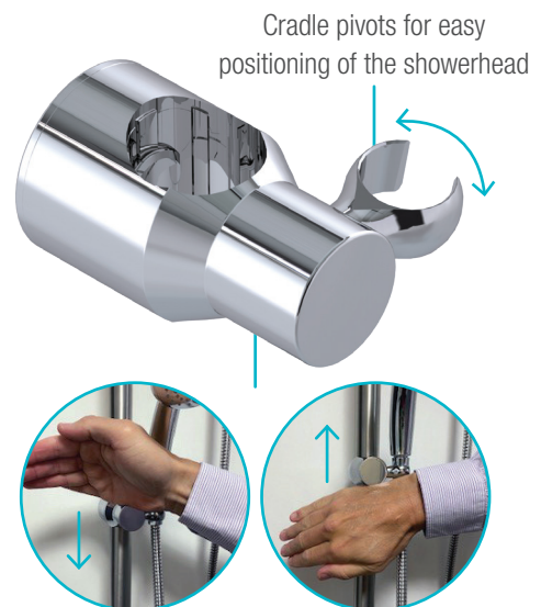
Designed for users with weakened or arthritic grip

The innovative design is extremely reliable and allows easy movement of the handset cradle up and down the grab rail. The Friction Slide Cradle is factory fitted, pre-tensioned, and arrives complete with your Con-Serv Premium Healthcare Shower.